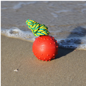
??? ?????? ??? ?????? ?????????? ? ?????????? ??????????